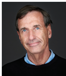
Scott Vaughan, International Chief Advisor, CCICED

The last decade was the first in history where more people lived in cities than in rural areas. The coming decades will see this trend continue and, by 2050, the UN predicts that more than two-thirds of the world's population will live in cities. 1 Cities are also economic powerhouses; they cover 2% of the world's surface, but drive 80% of its economic output. 2 Cities also consume the majority of global food production and, by 2050, will consume 80% of all food produced, meaning that a large percentage of rural economic activity is also connected to cities. 3